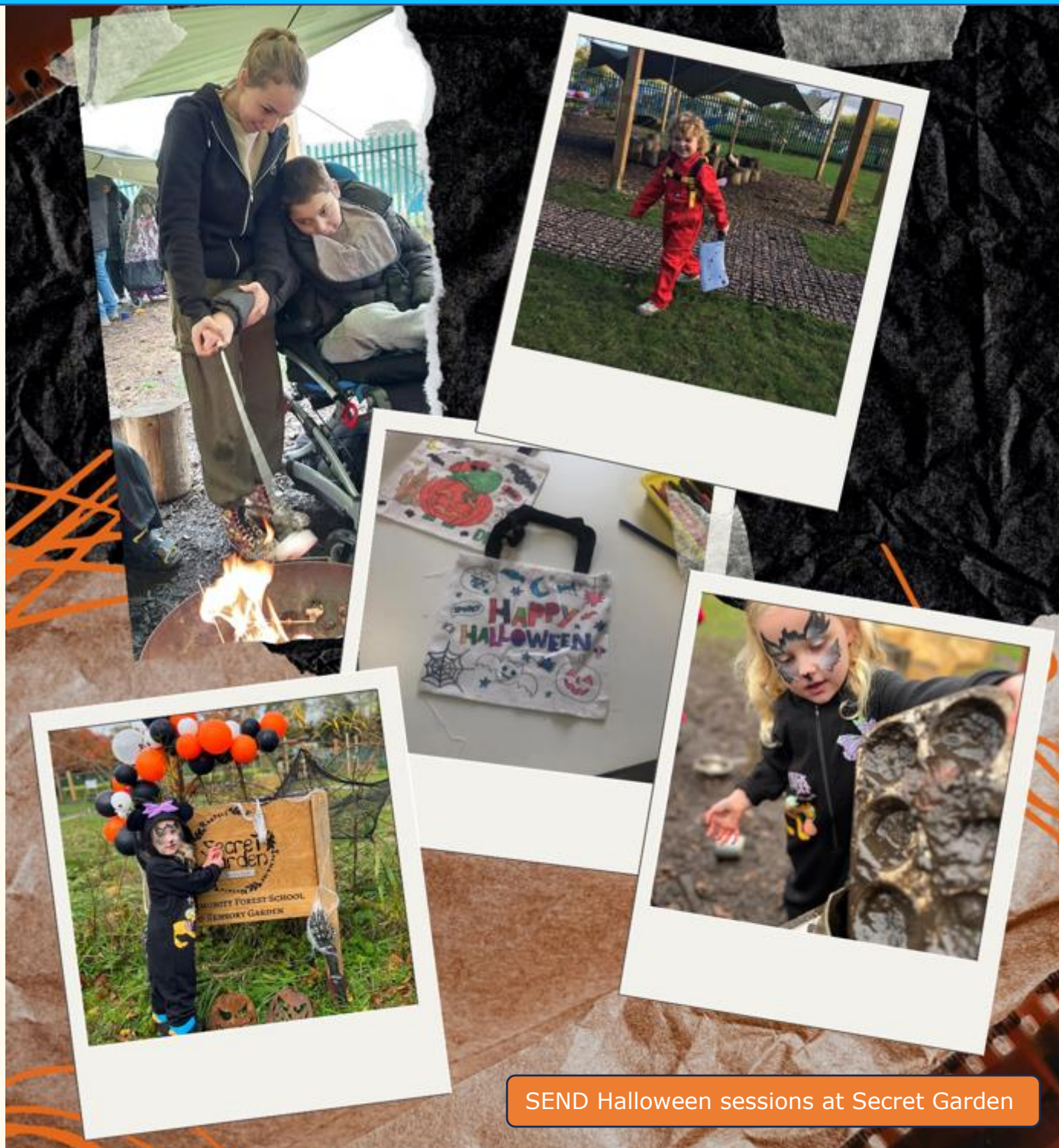
SEND Halloween sessions at Secret Garden